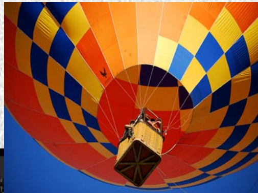
'Up, Up, & Away!' Stephanie Bevan